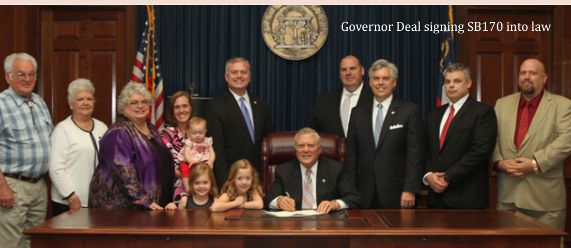
Governor Deal signing SB170 into law