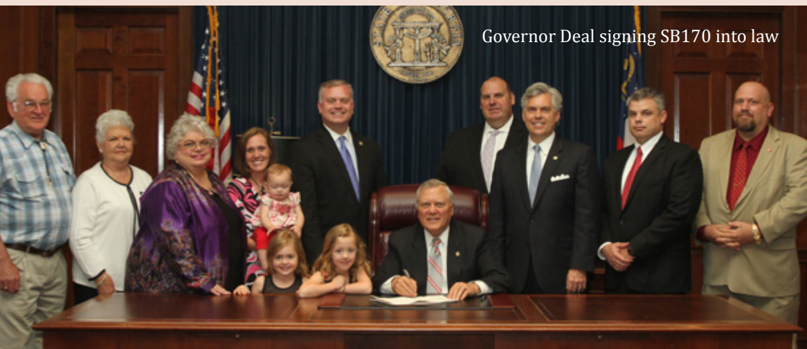
Governor Deal signing SB170 into law